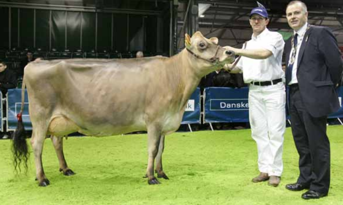
Supreme Champion Clandeboye CR Evita from Clandeboye Estate Bangor